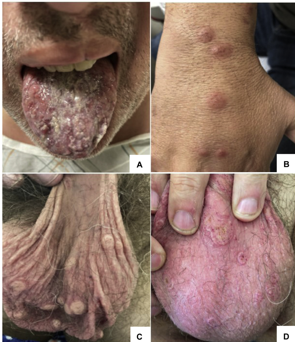
Fig 1. Physical examination revealed an enlarged, erythematous painful tongue with many papules and fissures with overlying exudate (A); erythematous, firm nodules with slightly eroded centers on the dorsal aspects of the hands and extremities (B); tan, firm verrucous nodules, some with central pinpoint hemorrhage (C), which progressively became more targetoid in appearance (D).

lambda. Thus, we diagnosed a case of SS with vasculitis and transient monoclonal IgA gammopathy, triggered by the Janssen Ad26.COV2.S vaccine.