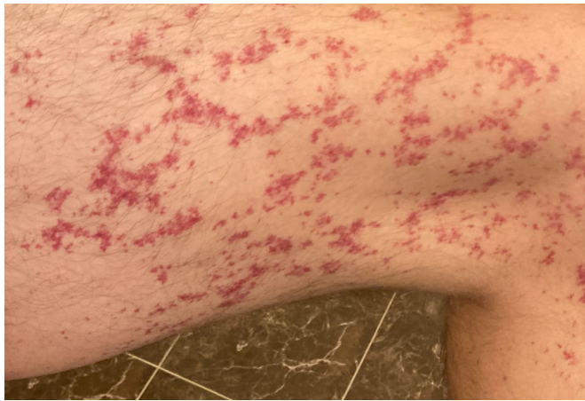
Figure 1 Petechial rash on the lateral aspect of the right lower limb.

such as skin biopsy of the rash and renal biopsy were not carried out.