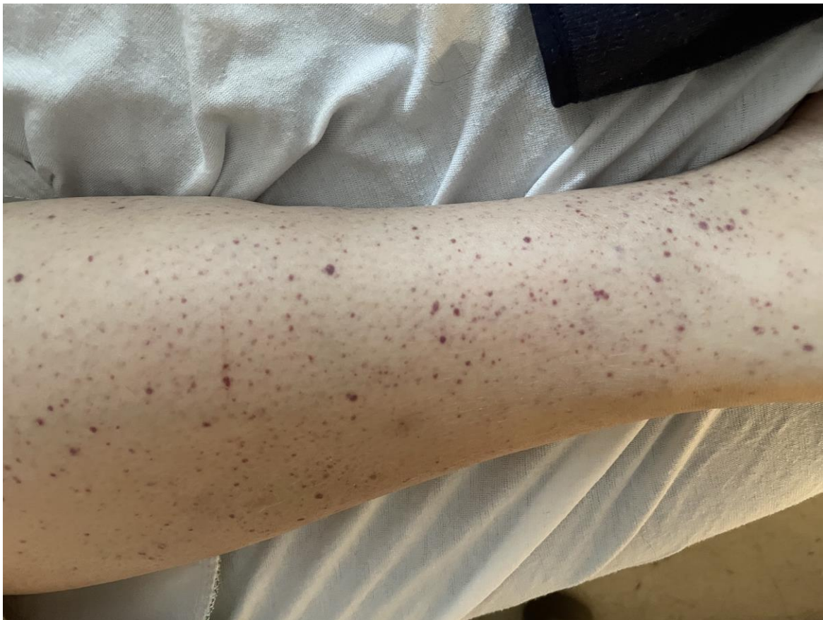
Fig. 2. Diffuse petechial rash on the patient's lower extremities (the right lower leg) - day two of hospitalization

The patient's first follow up was one week after symptom onset. At that time, her laboratory tests continued to demonstrate responsiveness to treatment (Figure 2, Day 8). She was tolerating the prednisone well, with no unexpected side effects. The prednisone taper was continued and follow up with laboratory tests was scheduled twice weekly for the first two weeks following discharge before switching to weekly visits (Figure 2). Her platelet counts remained normal at eight weeks, and a bone marrow biopsy was deferred given her treatment response. She will be followed over the following 12 months to monitor for recurrence.