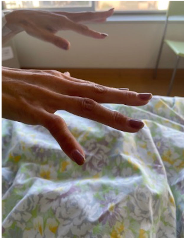
Figure 1. Pseudoathetosis. A state in which the fingers are separated from each other and cannot be aligned straight.

of the trunk and thigh. She was transferred to a rehabilitation hospital 20 days after admission.