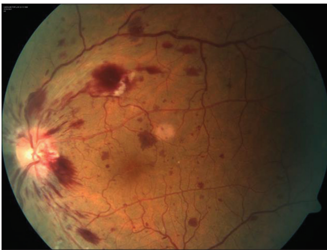
Figure 2: Color fundus photography of the left eye showing dot-blot and flame hemorrhages, dilated tortuous veins, and blurred margins in the disc especially in the temporal quadrant

young patients, hematologic disorders. [2] Our patient had no previous history of any of these conditions.