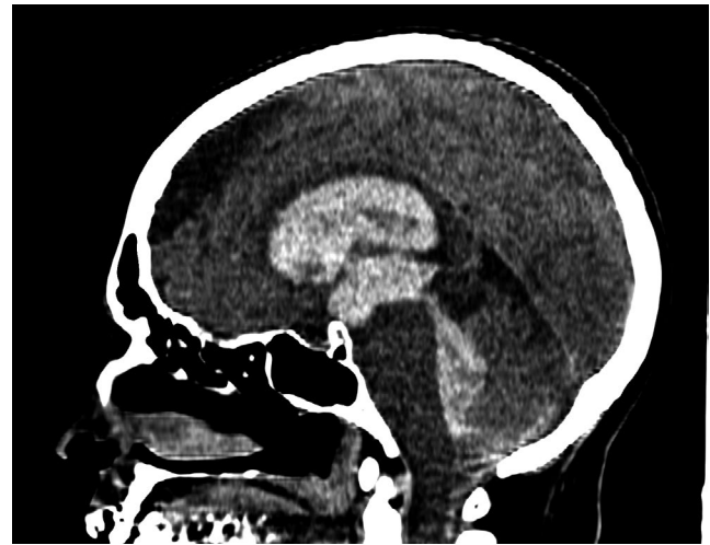
FIGURE 2 Computed tomography of brain (sagittal view) showing inundation of the entire ventricular system

Authors thank patient's family members for consent with this publication.