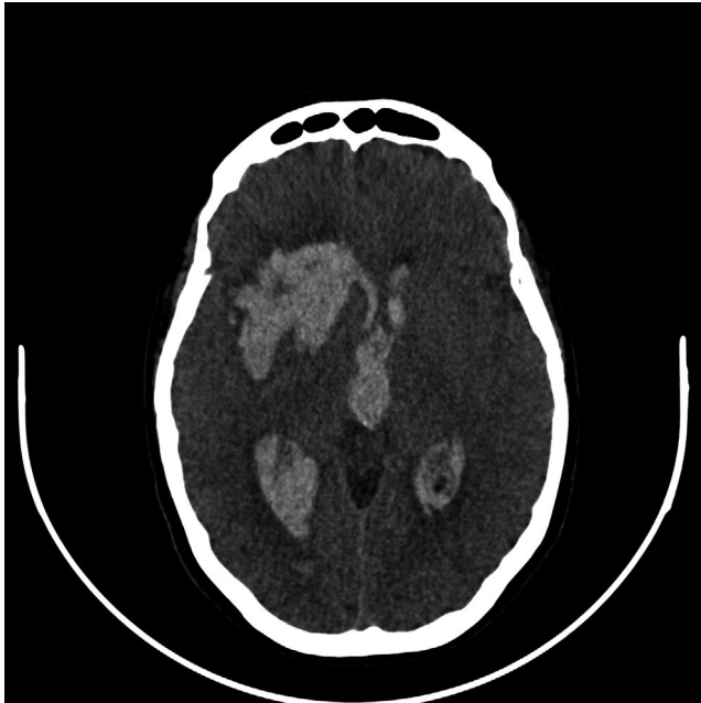
FIGURE 1 Computed tomography of brain (axial view) showing a large right deep frontal lobe parenchymal bleeding. Also note the midline shift and the black spot sign, suggesting a growing hematoma

of the vaccine. On day 5, she had a sudden onset of sweating and paleness, which has followed by left hemiparesis, vomiting, and somnolence. She came to the emergency room with a Glasgow Coma Scale of 7 and required orotracheal intubation; blood pressure was 160 × 90 mmHg. Computed tomography showed a large right deep frontal lobe parenchymal hematoma with the inundation of the entire ventricular system (Figures 1 and 2). Platelets count, fibrinogen, prothrombin time, and D-dimer were normal. Digital subtraction angiography did not show any signs of thrombosis or aneurysms in brain circulation. She underwent hematoma drainage and external ventricular drain, but intracranial pressure kept raising and she underwent decompressive craniectomy. We also did not find any signs of thrombosis in other sites. At the time of submitting this report (day 15), she is left hemiparetic, capable of obeying simple tasks, and on tracheostomy.