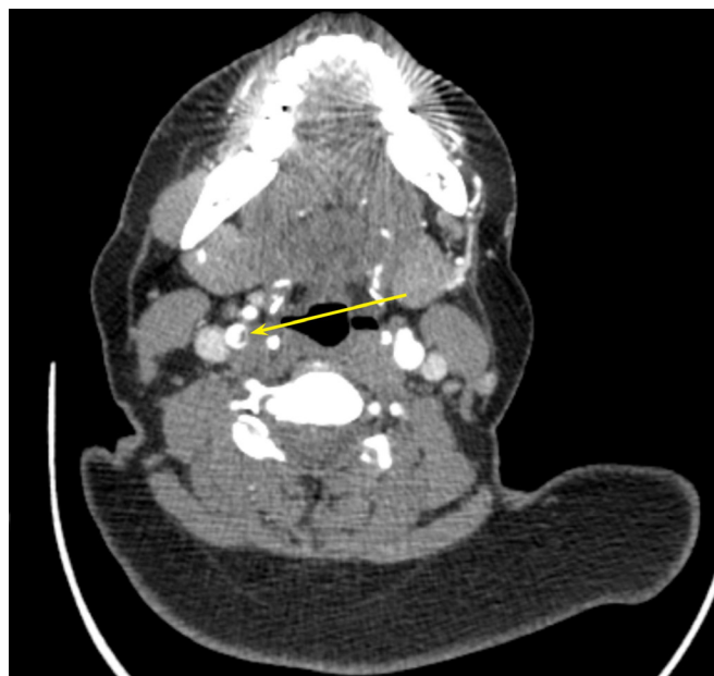
Figure 3 CT angiogram demonstrating partially occlusive thrombus in the right internal carotid artery (yellow arrow).

CVST is a rare condition that affects 0.22–1.57 per 100 000 population annually and accounts for approximately 0.5%–1% of all strokes per year. 9 The median age of patients presenting with CVST is 37 years old and approximately 8% of patients are 65 years of age or older at the time of diagnosis. Multiple identifiable risk factors have been identified, including prothrombotic conditions (inherited or acquired), use of hormone therapy (including oral contraceptive pills), pregnancy and the post-partum period, malignancy, infection and mechanical precipitants (lumbar punctures). As of 12 April 2021, there have been