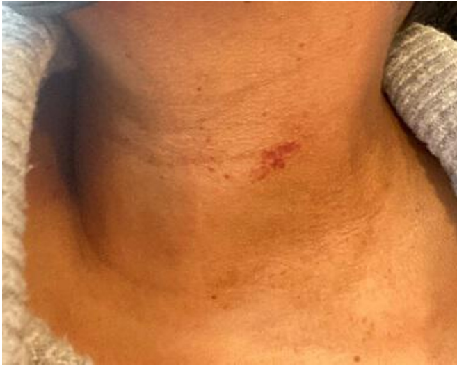
Figure 1 Petechial rash.

pregnancy test and serum lactate that was transiently elevated on HD 3 to 3.3 mmol/L (0.7–2.0 mmol/L) but normalised to 1.9 mmol/L by HD 5. An abdominal ultrasound with Doppler showed normal liver and spleen morphology with no identifiable thrombus. On HD 4, a liver biopsy was performed showing no granulomas, steatosis or evidence of necroinflammatory injury. The patient was started on N-acetylcysteine (NAC), though acetaminophen and salicylate levels were unremarkable. Her total bilirubin peaked at 2.1 mg/dL (0.2–1.2 mg/dL) on HD 3, with mixed component of direct and indirect bilirubin. On HD 5, her total bilirubin was normal at 1.1 mg/dL, AST and ALT improved to 175 U/L and 763 U/L, respectively. Given her normal platelet count and improving transaminitis, the patient was discharged with outpatient follow-up on HD 5.