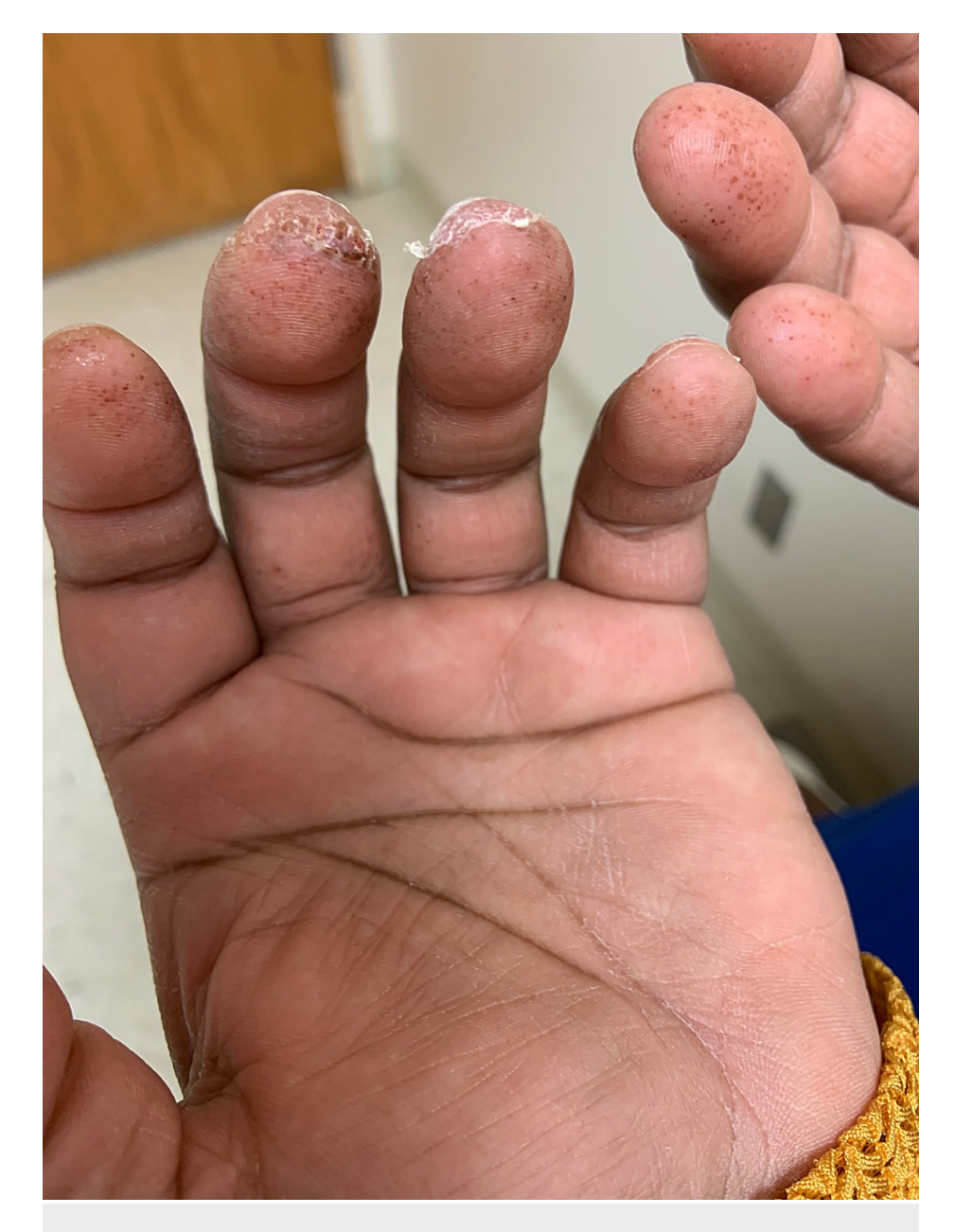
FIGURE 1: Petechiae and desquamation of patient's fingers