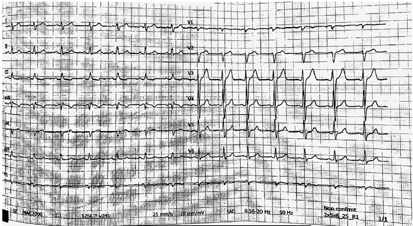
Fig. 1 – ECG recording on arrival at the emergency department, showing sinus rhythm and no significant abnormalities.